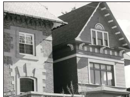
The home on the right was restored after severe damage and neglect.