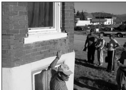
CPR members organize workshops on historic preservation techniques.

CPR also gives awards to owners of residential and commercial buildings, increasing public awareness of outstanding renovation efforts.