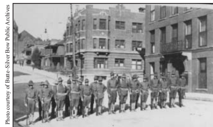
CPR helped to keep the O'Rourke Apartments (background) from demolition. (Photo shows federal troops in Butte during 1914.)

CPR keeps abreast of initiatives by local government and business and civic organizations, supporting or opposing them and offering development assistance as appropriate. CPR was instrumental in improving Butte-Silver Bow's sales of tax delinquent and surplus properties. CPR members have been appointed to the Historic Preservation Commission and County Planning Board.