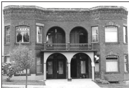
This beautiful example of a restored multifamily structure was opened during a home tour.