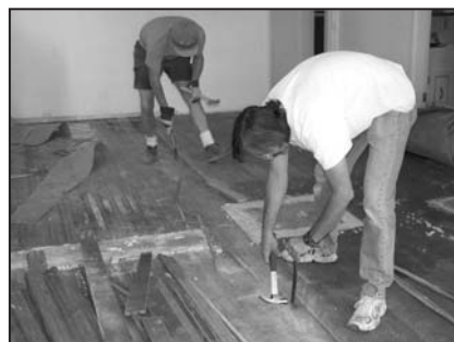
Volunteers remove architectural items from buildings destined for demolition or renovation.

When demolition is unavoidable, CPR salvages historic architectural features and sells them for recycled use in historic buildings. CPR volunteers have organized major salvage efforts of commercial building and various residential properties. CPR was able to salvage maple, oak, and fir flooring, staircases, moldings, pillars, hardware, doors and door frames, casings, baseboards, drawers, "tin" ceiling tiles, marble, windows, banisters, and bathroom furnishings. Also, a significant number of architectural items are donated by individuals. If you would like to donate or purchase items, check our website http://www.buttecpr.org .