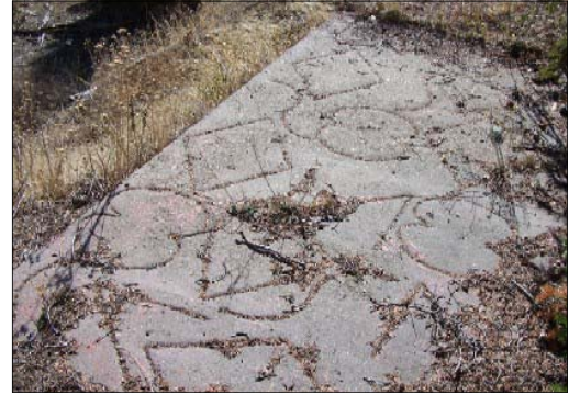
Part of the patterned concrete deck at the site of the Foreman's House, Mountain View mineyard.

Several people have joined the list requesting specific materials, including clawfoot tubs (we have some donated, at the old Sears building—needs a work party), water fountain, hairpin fencing, iron fencing, and big slag bricks.