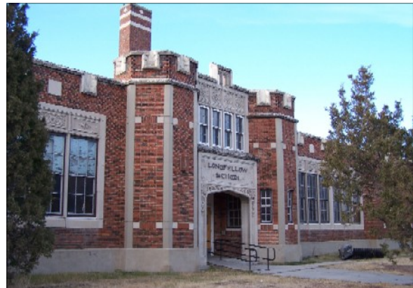
Longfellow School, a National Register property demolished in 2007—now one of Butte’s lost treasures.