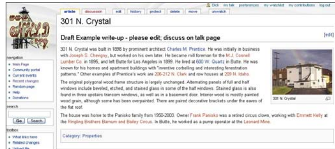
Screenshot of an early article in the wiki.

At this writing we have about 320 articles set up